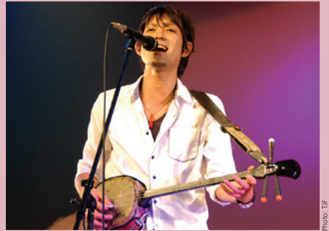
Many of my songs in concert feature the sanshin.

After graduation from university, while supporting myself with a part-time job at a pharmacy and by playing classical music and Okinawan folk songs, I wrote songs and gave live performances. My goal was to release my first CD, so every time I wrote a new song, I visited a music producer living in Okinawa. I would wait in the back quietly until the producer's work was finished, and as soon as there was a moment, I would ask, "Could you listen to my song, please?" At first, I wasn't taken very seriously, and was always told to come back when I had written a new song, but I didn't give up. I continued to work and rework my songs and visit the producer. After about two years of persistence, I finally came up with the song "Kassen soka 夏鮮想歌," a term I made up that means "vivid summer memories." The song is about someone falling in love with a girl at a summer festival on an island. Even though the relationship doesn't last, it becomes an important memory for the character in the song. He feels happy at the thought of her, probably striving towards something, somewhere. The producer really liked this song and agreed to put out my debut single. I will never forget the happiness I felt when that dream came true.