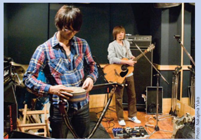
Rehearsing for a concert.

While in university, I devoted most of my time to my studies, rehearsing for classical music performances at university, and playing classical music and Okinawan folk songs (min'yo) at public events. I wasn't spending much time writing or performing my own songs back then.