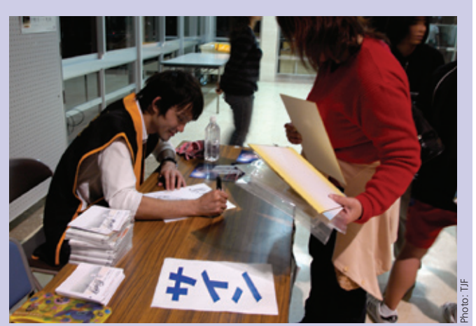
Signing albums after a charity performance on Izena Island. I get specially nervous when giving performances on the island, but everyone is really warm and supportive.

It was a tough year for me, even looking back on it now. But it was an ordeal that taught me the importance of believing in your goal and firmly pursuing it. I became stronger mentally and able to see things from various angles. Without having experienced this hardship, I never would have reflected on my dreams and my professional career so seriously and I probably couldn't have endured the busy schedule that followed. Today, I'm thankful for those tough days that I endured.