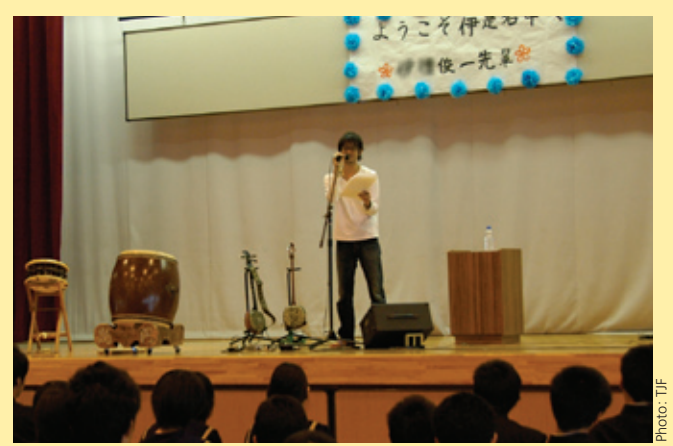
Giving a speech at the junior high school on Izena. I wanted the students on the island to know "you can achieve your dreams."

I would also like to do as much as I can to help the Izena Island community. I've already done a few charity concerts on the island and donated proceeds from them to the local junior high school. I would like to continue to participate in events to help revitalize the island or maybe live in Izena when I'm famous and contribute taxes to the island . . . well, I'm going to have to become popular first, won't I!