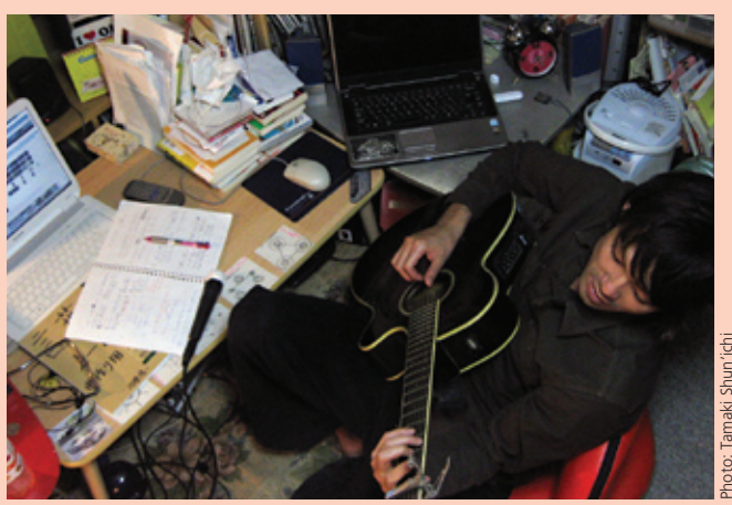
Writing a song at home.

I write songs that carry the message, "A lot of things happen in life, but I'm striving to do the best I can." I feel