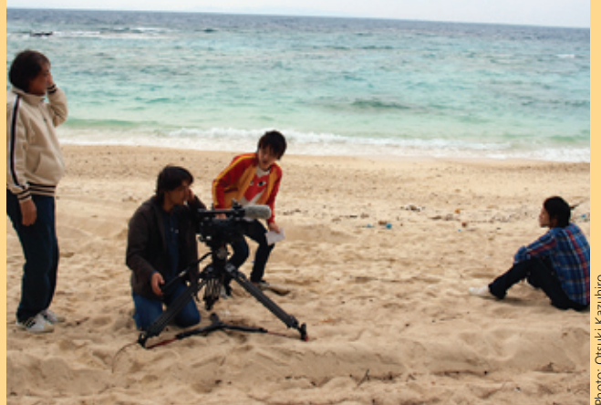
Shooting a promotion video on an Izena Island beach

I was desperate to regain my voice, but the more I struggled, the worse the symptoms became. I couldn't even sing scales properly. I had no desire to appear on stage, but concerts had been booked far in advance and couldn't cancel them to give my voice a rest. Frequently, I would be close to tears during my performances because I couldn't sing properly in front of thousands of people. Everything had been fun up until then, but I learned then how tough it is to be a professional musician. I began to realize that no matter what I might do, my voice might not return to normal. I might have to quit music. In the end, I didn't quit because I couldn't see myself as anything but a singer-songwriter.